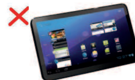
Any Android tablet