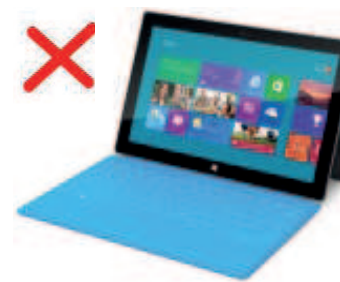
Microsoft Surface RT

* Wi-Fi Specifications for any BYO Laptop - Wireless N. "Full" version not draft